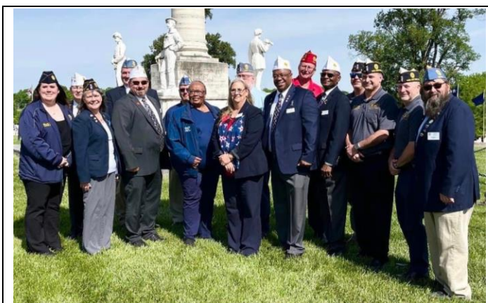
Members of the Ohio American Legion Family during Memorial Day Graves Decoration at Dayton National Cemetery.