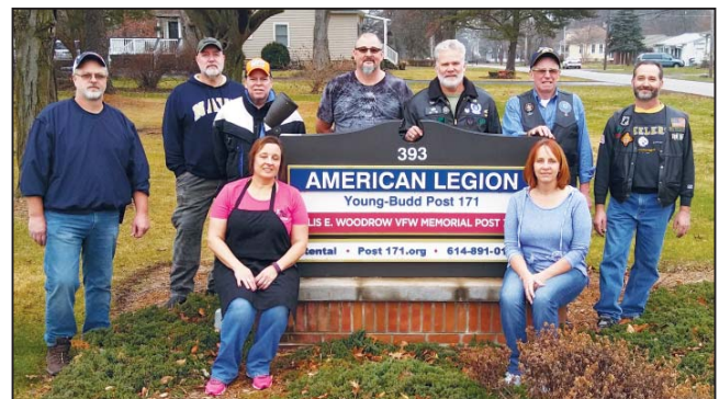
For a fourth year, members of ALR 239 hosted breakfast for the HOG Polar Bear Run and raised over $2,500 for the Legacy Scholarship Fund. The annual HOG New Year's Day Polar Bear Run breakfast hosted nearly 200 bikers.