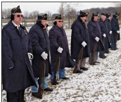
Wood County Honor Guard

Defience • Fulton • Hancock • Henry • Lucas • Ottawa • Paulding • Putnam • Williams • Wood