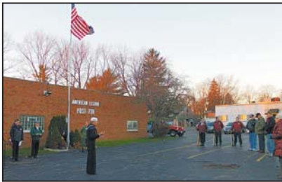
Members of Post 738 in Fairview Park conduct Pearl Harbor Remembrance Day ceremonies at the Post home on December 7.