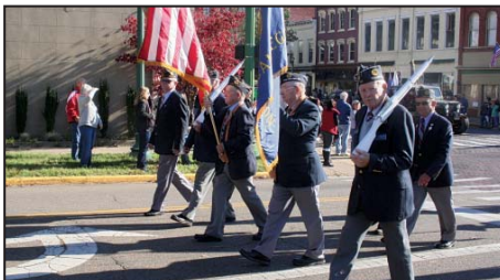
Post 750 took part in Marietta Veteran's Day program. Post 64 was in-charge of the program.