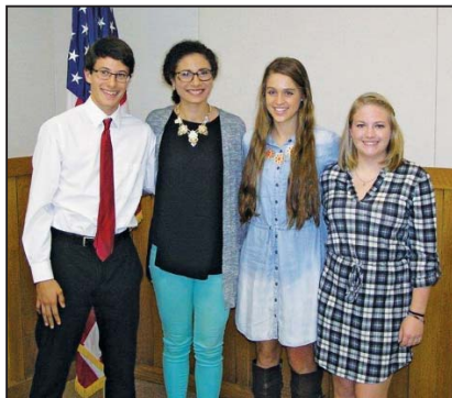
Post 444 held their annual Veteran's Banquet with the Boys State and Girls State students attending.