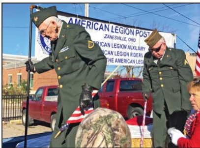
Post 29, Zanesville - World War II veterans departing the Post's Veteran's Day Parade float on November 5, 2016.

Belmont • Guernsey • Monroe • Morgan • Muskingum • Noble • Washington