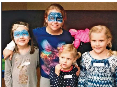
Post and Unit 63 hosted the annual Veteran's Children Christmas Party on Dec 4th. The event features activities and a visit from Santa. One particular event is the face painting. Thank you to all who donated