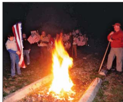
Members of Boy Scout Troop 97 in Sidney removed flags from the cemetery on November 12th and a modified ceremony was held by Post 217 to respectfully retire the approximately 4,000 worn and tattered flags.