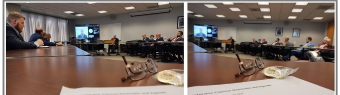
There was a good turnout for the monthly Veteran Legislative Caucus meeting at the Vern Riffe State Office Tower on Tuesday, October 3rd.