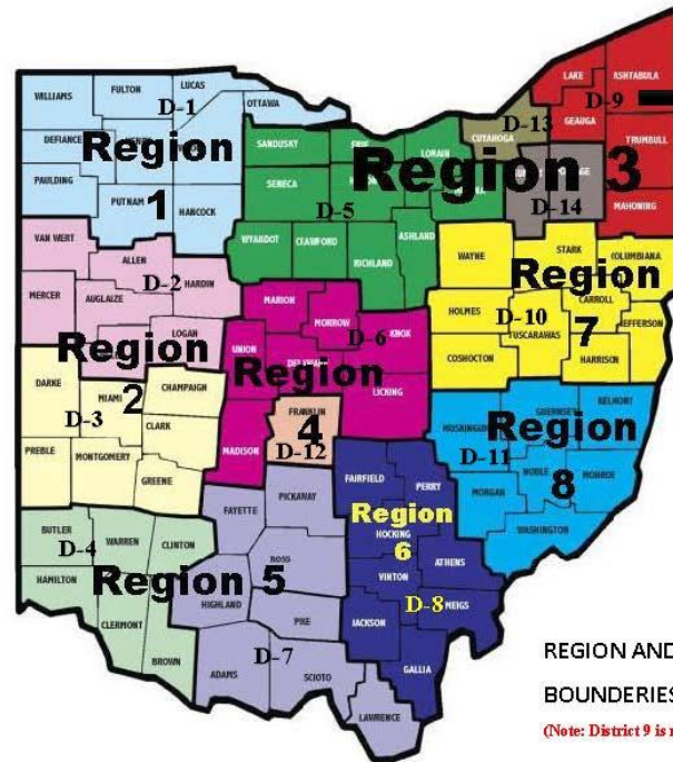
The American Legion – Department of Ohio

Note: District 9 now falls under Region 7.